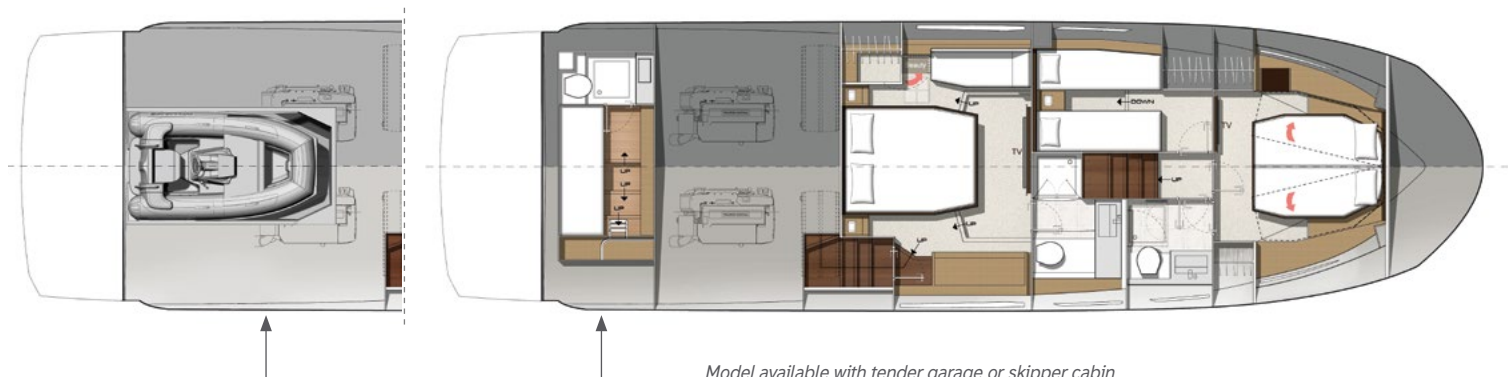
Model available with tender garage or skipper cabin