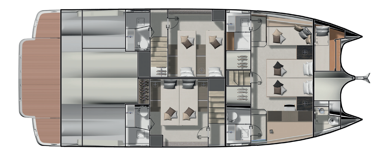
3 staterooms / 3 bathrooms